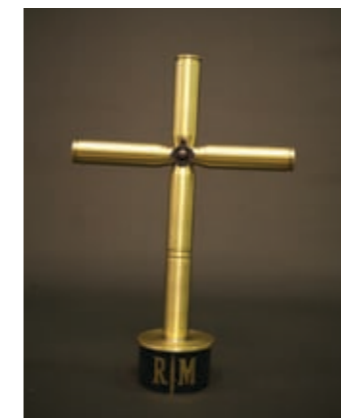
altar piece, made from 30mm shells. Camp Bastion, Op. HERRICK 9, 2008-9

In scope the material includes fine and decorative art – from commissioned watercolours to modern day equivalents of trench art. Evocative material is also encompassed, including a body armour and helmet associated with acts of gallantry. More simple everyday items have been collected. These include nearly a dozen different types of boot used over the duration of the campaign, through to privately produced tour t-shirts.